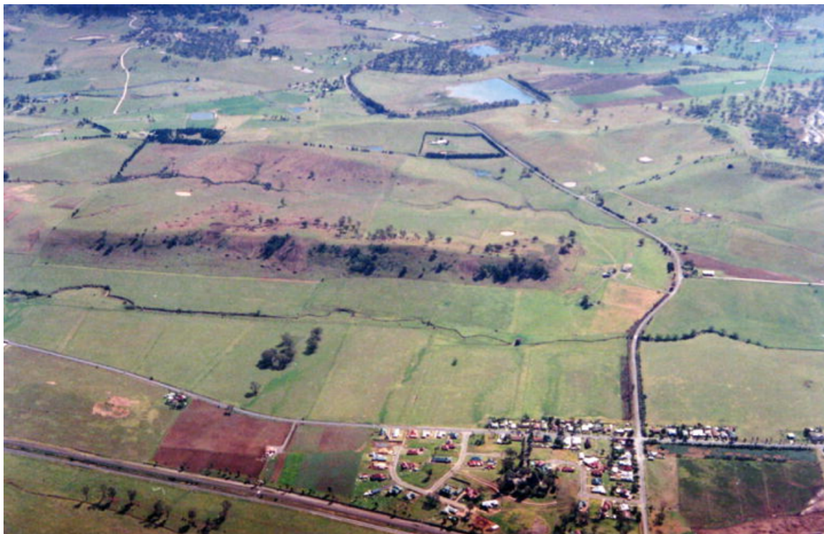
Figure 2 Aerial view of Menangle village showing the Southern Railway in bottom left of image. The rotolactor paddock is bottom right of image (Camden Images, 1996)

The state sponsored planning processes that background the development proposals discussed in this paper take place under the administration of a number of state governments. They started with the Askin Coalition state government (1965 to 1975) which developed the Sydney Region Outline Plan. In the early 1970s both the state and federal governments came under community pressure around heritage issues which were subsequently reflected in planning proposals for the Macarthur region, which included Menangle. The paper then moves onto the recent development proposals at Menangle and the planning regimes of the Carr Labor government (1995 to 2005), followed by Labor Premiers Iemma (2005), Rees (2008), and Keneally in 2009. The planning regime was changed by the election of the O'Farrell Liberal-National Party Coalition government (2011 to 2014) and consolidated by later Coalition leaders Mike Baird (2014) and Gladys Berejiklian (2017).