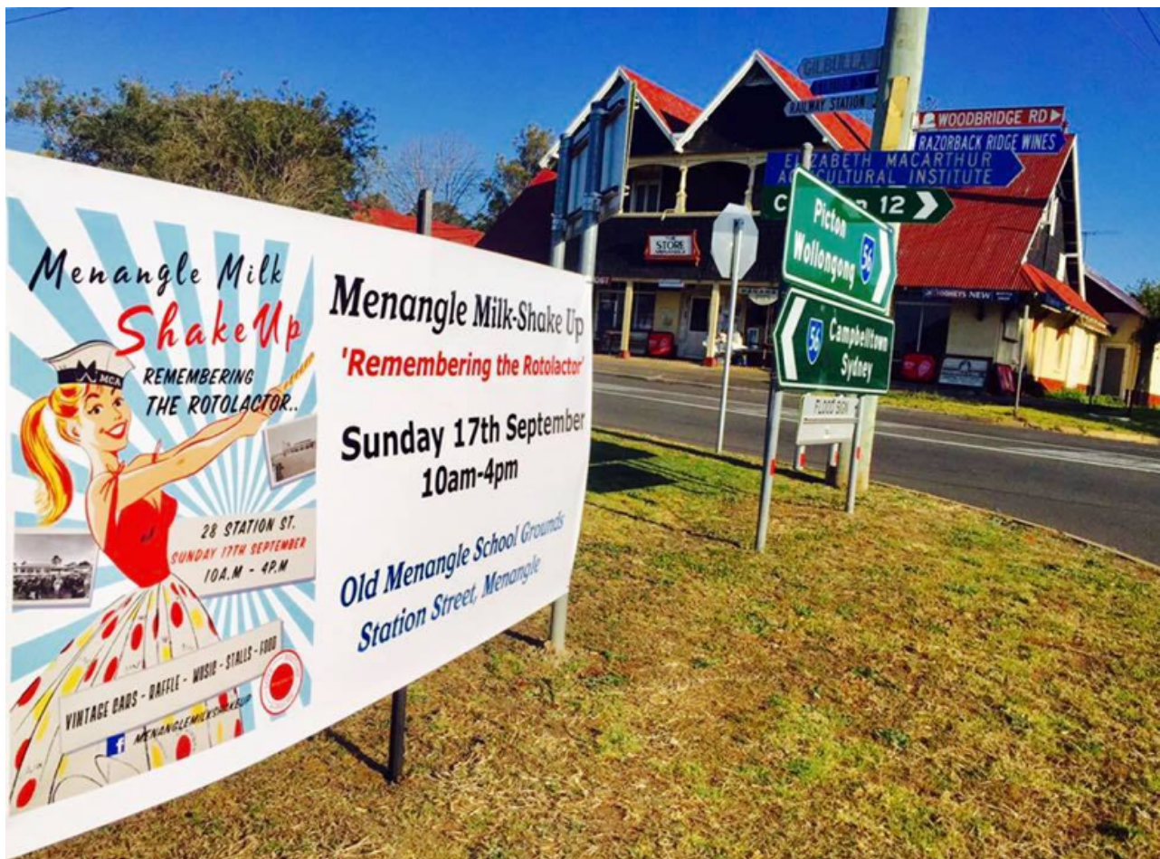
Figure 5 The Menangle Community Association held a community festival that attracted thousands of visitors to the village. In the background of this image is the Menangle General Store built in 1904 designed architects by Sulman and Power for Camden Park Estate (MCA, 2017)

By 2017 control of the Moreton Park Road and Station Street precincts had passed to Mirvac Developments. Mirvac lodged a proposal for 5000 housing lots in the Moreton Park Road area with Sydney South West Planning Panel of the Berejiklian state government. Wollondilly Shire Council opposed these plans and Councillor Lowry complained that the shire should be defended from Sydney's urban sprawl. ( Camden Narellan Advertiser , 17 May 2017) Wollondilly Council received support in their opposition to the new housing development from Camden and Campbelltown councils. ( Camden Narellan Advertiser , 17 May 2017.)