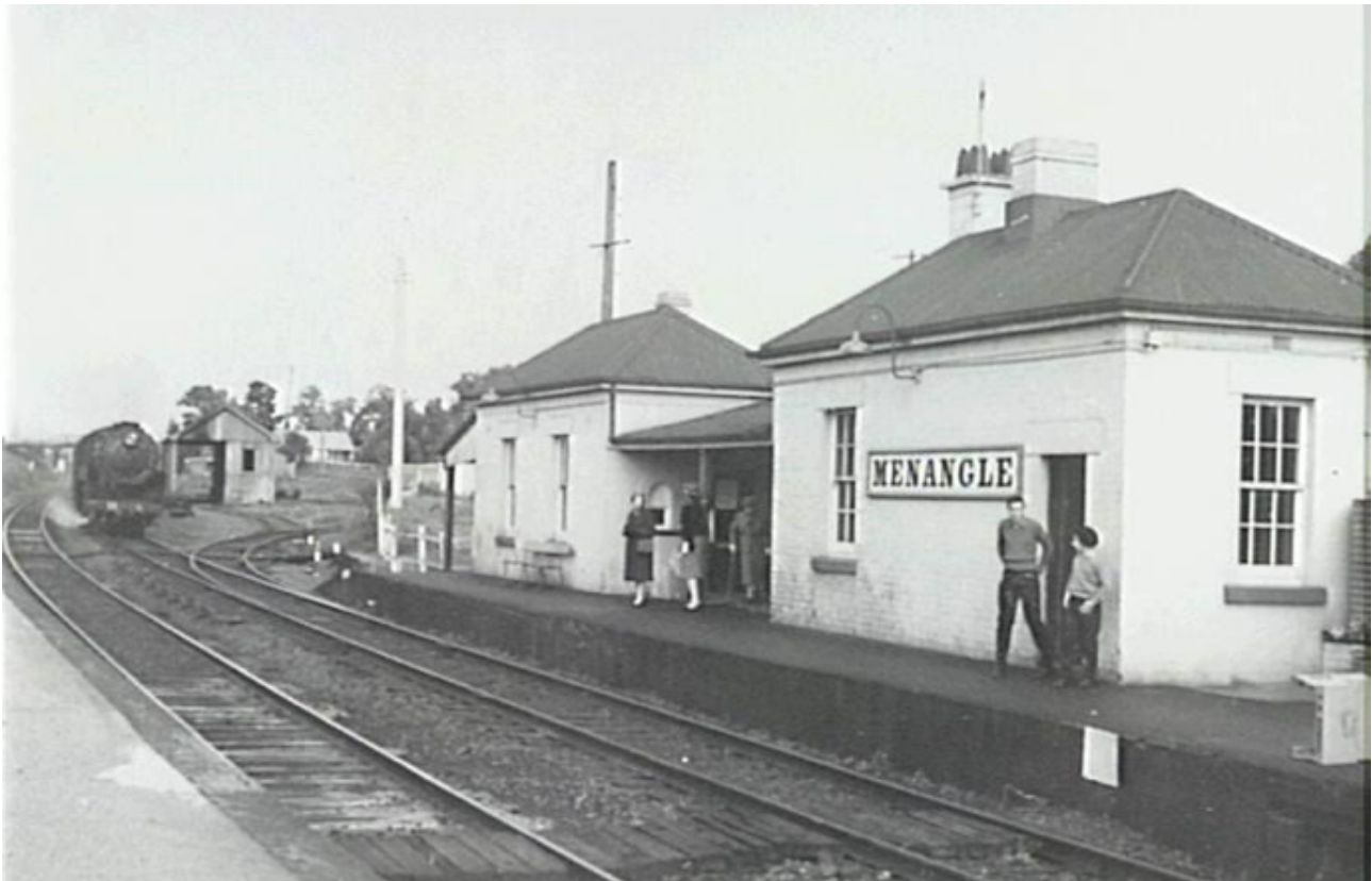
Figure 4 Menangle Railway Station on the Southern Railway Line between Sydney and Melbourne with a steam train approaching the station from the south

The following year in March 2011 the O'Farrell Coalition State Government came to power and the developers tried again to have the Moreton Park precinct re-zoned. This time the developer sought an amendment to the Wollondilly Local Environment Plan through the government's Sydney West Joint Regional Planning Panel. (Betteridge 2010, pp.20-21) By 2014 the shortcomings of the site had still not been overcome by the developers and the preliminary gateway assessment was rejected. (SouWest Developments, 2015)