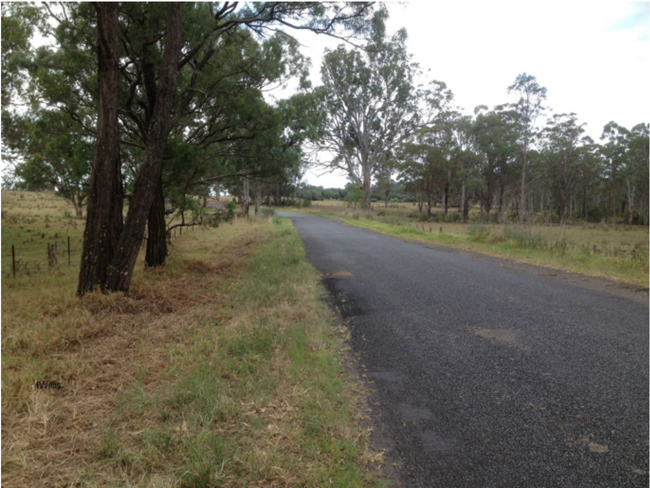
Figure 3 Moreton Park Road precinct located east of the Menangle village and adjacent to South Western Freeway and Southern Railway Line (I Willis, 2017)

Menangle ‘residents did not understand the proposal’ and that they had addressed the concerns of residents after the initial public meeting in November 2004. ( Camden Advertiser , 12 January 2005) Despite these assurances community anxiety continued to grow. Another public meeting was held in March 2005 at the Douglas Park Community Hall where ‘angry and confused residents’ packed the hall. Wollondilly Shire Council Mayor Banasik stated that the proposed rail, road and warehousing interchange was ‘bigger than Ben Hur [and would] change the face of Wollondilly’. The community meeting was attended by four councillors and the council general manager. ( Camden Advertiser , 30 March 2005) The developers stuck to their original position that they would always ‘consult both the council and the community’. ( Camden Advertiser , 30 March 2005).